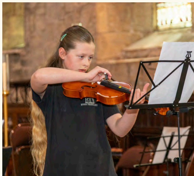
First ever concert playing the violin. It went rather well