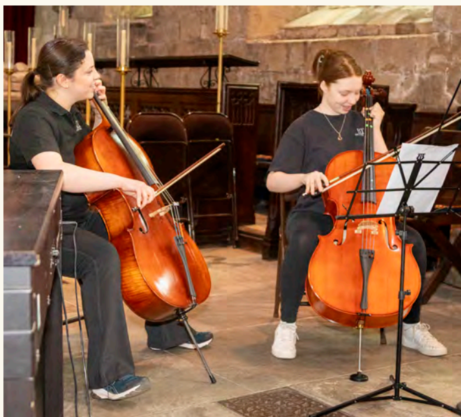
Bourn Theatre Arts entertaining the Spring Fair