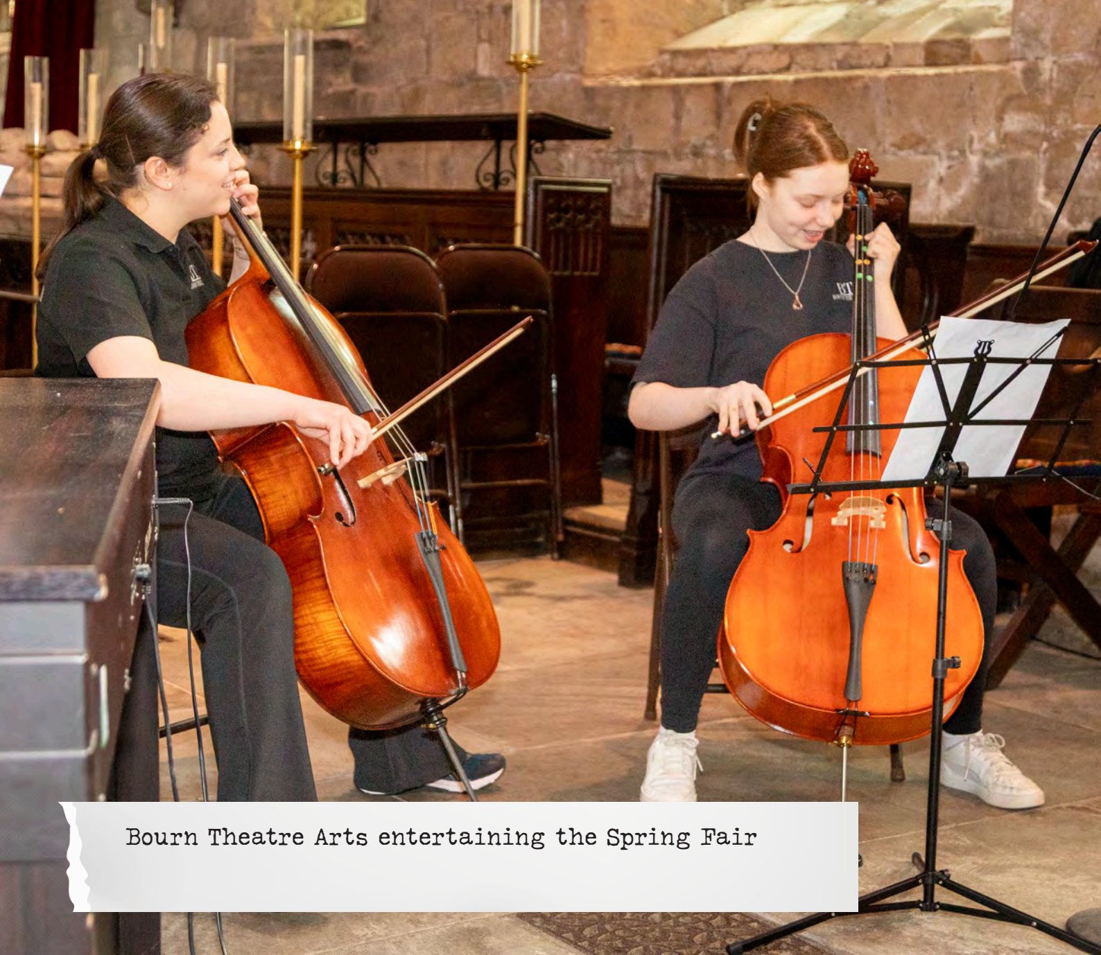
Bourn Theatre Arts entertaining the Spring Fair