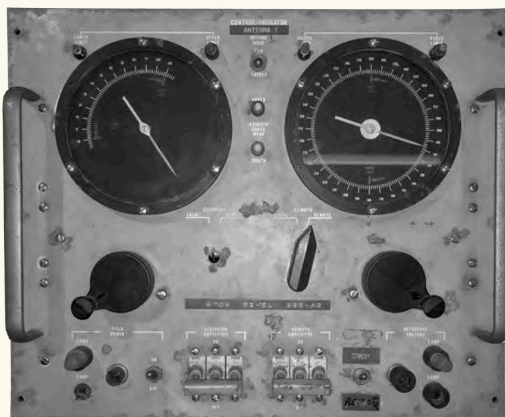
Tune into God's Radio...