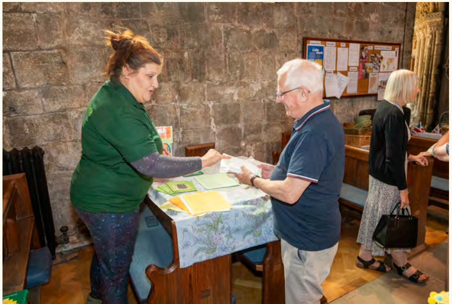
The Yorkshire Rotters stall converting Vyv to the benefits of recycling