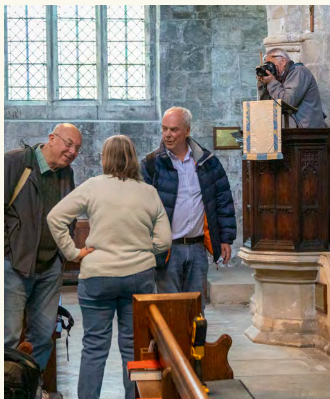
There was as much nattering as picture taking :) but this had to be curtailed because of a health issue. Instead the photographers took images of the church. Around 15 photographers took part.