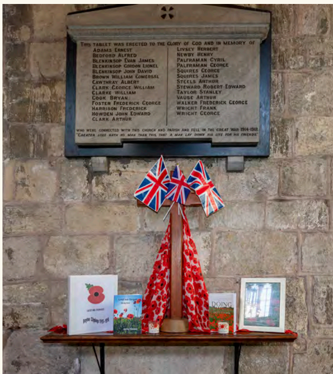
VE Day memorial in St Wilfrid's Church St Wilfrid's was decorated to respect the 80 th Anniversary of VE Day on 8 th May. I was reminded of the generous donation of food parcels by the Fox