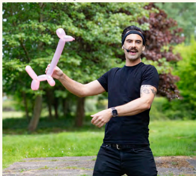
Et voila! A balloon fox! Or something