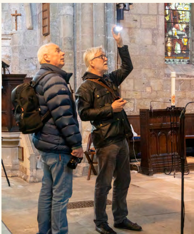
Camera Club members examining the nave capitals Selby Camera Club paid a visit to St Wilfrid's on the evening of 8 th May. Originally the Club had arranged to photograph two Civil War re-enactment models,